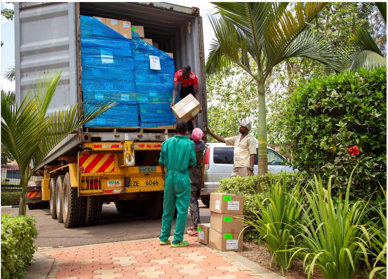
Unloading long-awaited study resources in rural Uganda